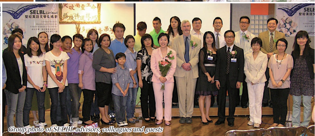
Group photo of SELBL advisors, colleagues and guests