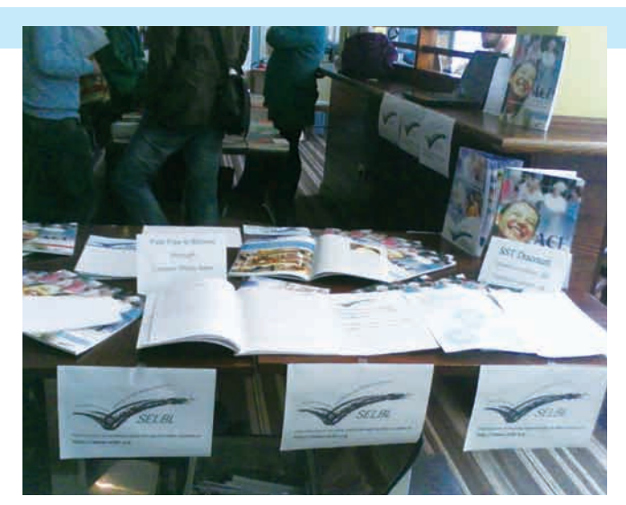
SELBL's ACE course books were exhibited at York University, alongside Oxford University Press, Routledge etc.