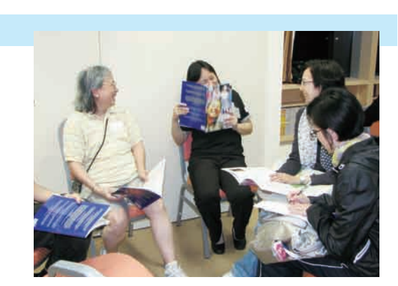
ACE Course students in Hong Kong actively engaged in discussions.

As a pastor for ten years teaching Bible on many occasions, it is a fresh experience for me to teach English through the English Bible as well as to share the Gospel by means of teaching English.